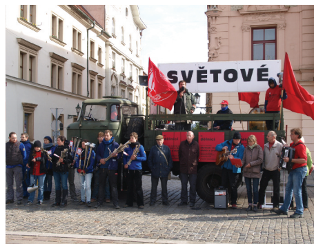
Fifth truck: Workers from several companies The struggle of the working-class