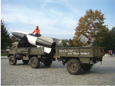
First truck: The chancellor Merkel, riding on a V2-rocket, and a capitalist The German government a faithful accomplice of the capital

The convoy did commence on September 29th, 2013 in Munich. 75 years earlier the Munich Dictate had been decided, which led to the annexation of a part of the Czech Republic by German Fascism. On its ten day journey, the campaign-convoy trailed through several cities, stopping at large-scale factories, vocational schools, working-class districts and city centres in the FRG and the Czech Republic, and came to its temporary end in Prague at October the 8th.