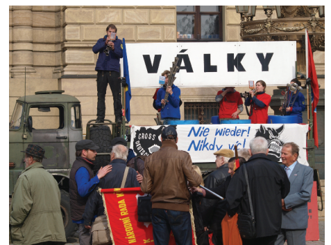
Sixth truck: Youth of several youth-organisations United struggle of the youth against the war

This campaign-convoy is a street-theatre to encourage contemplation, aiming to warn against the next world-war, which is being prepared by the ruling classes, which we – Workers and Youth – have to struggle against