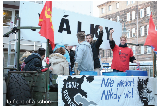
In front of a school

Demonstration in front of a school - Spontaneously several students decide to join us for a while and enter the Youth-Truck. A vocational-school student, addressing a leaflet distributor: "I thought, war is always good!" "No", says a young comrade from Ingolstadt down from the Youth-Truck and points towards the Anti-Aircraft-Helper on the trailer of the first truck. "That one" he says, "may as well have thought, he would come through, while Germany wages war and then found himself in that very uniform." And a Czech comrade tells the youth: "When Czechoslovakia was surrendered to the German war by the Munich Dictate 75 years ago, it was a catastrophe for not only my people. It was a catastrophe for the German people as well. Because the war of the German capital with its 60 million deads came back to the country which had tolerated and prepared it. We are not here to blame each other. We are here to prevent this to ever happen again!"