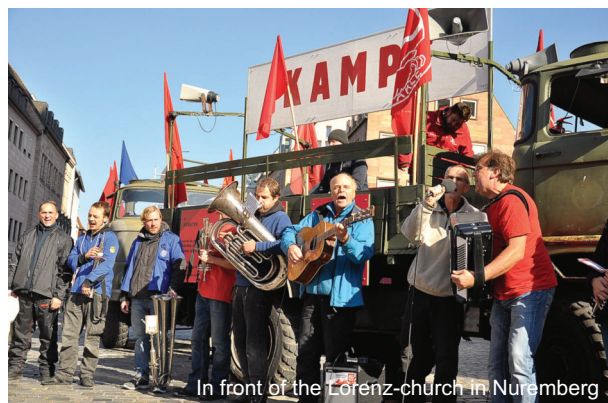
In front of the Lorenz-church in Nuremberg

The people here are being asked: „How will you decide? Next time you think that it would be good for you, for your job and your account to help the German rulers to rule the whole continent, contemplate! The German people does not have anything good to expect, when their rulers make the continent hate their country, their economizing-dictate, their tax-, donation-, interest-collectors. For how long can this go well in a world where millions, for the sake of their sheer survival, are forced to organise for to overthrow the existing system? This campaign-convoy asks: Become a murderer on the side with your rulers and perish, or get onto the side of those, who, today, fight against the upcoming war and say: A third time with us – No! You have to decide!“ The effect of this demonstration was some applause and some people joining us for a while.