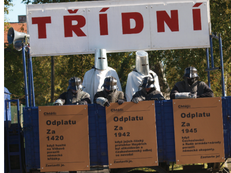
Second truck: 600 year old figures of German aggression against the Czech Republic German eastward Invasions have a long tradition

Its trailer: A German boy in the uniform of a Hitler-Youth anti-aircraft battalion War comes back to the aggressor's country