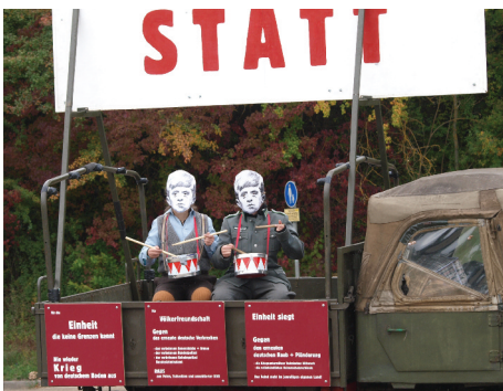
Fourth truck: Oskar Matzerath from Günter Grass's novel "Blechtrommel" (tin drum) with two faces The petite-bourgeoisie is undecided: Join the ruler's war or take sides with the working-class and the progressive youth