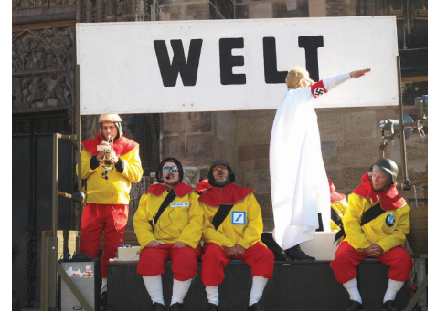
Third truck: German dwarfs bearing steel helmets, an impersonator of the Germania-statue in a coffin The fifth column in the Czech Republic